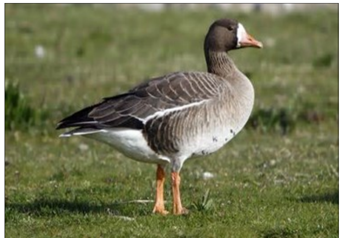
Greater White-fronted Goose, Anser alibifrons

As we announce at the end of our weekly reports, "The Monday Morning Bird Walk has been a weekly event at Huntley Meadows Park since 1985. It takes place every week, rain or shine (except during electrical storms, strong winds, or icy trails), at 7AM (8AM from November through March), is free of charge, requires no reservation, and is open to all. Birders meet in the parking lot at the Park's entrance at 3701 Lockheed Blvd, Alexandria, VA. Questions should be directed to Park staff during normal business hours at (703)768-2525." So, come on out and join us - 7AM in the summer, and 8 AM in the winter.