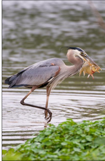
Great Blue Heron eating a Sunfish by Curtis Gibbens

My birding knowledge grew over the years thanks to many friendly and helpful birders. I learned a lot about different species, migration, what bird(s) you are most likely to see at a certain time, and what comes or leaves when the wetland changes.