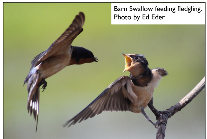
Barn Swallow feeding fledgling.