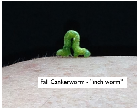
Fall Cankerworm - "inch worm"

Informed decision-making based on good science also inspires me and we all deserve this. Fairfax County Officials are pursuing an insecticide spraying program against the native Fall Cankerworm that is not supported by good science. This is not inspirational, rather it is disappointing. This is an important opportunity for all of us to ask tough questions and insist on getting answers.